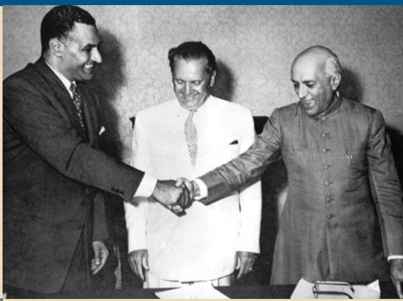
Оснивање покрета несврстани.

Having in mind that India is today`s driver of global growth, and Serbia, on the other hand, is one of the most promising economies in the Balkans, the potential for cooperation can be realized in different areas.