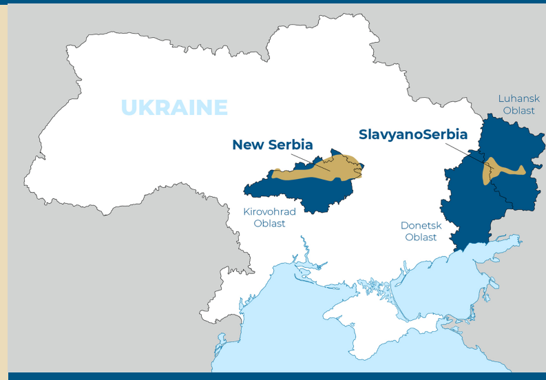
Map of New Serbia and SlavyanoSerbia regions in the territory of today`s Ukraine

Centuries of turbulent historical struggles for territories between the great powers were also marked by intensive migrations of Serbs which lasted from the 15th to the 19th century. After the Pannonian plain, since the end of the 16th century, they were moving to today's Ukraine. They built settlements there, and they also participated in the Ukrainian liberation movement. In the middle of the 18th century, two special territories were formed - New Serbia (1752-1764) and SlavyanoSerbia (1753-1764). These provinces were autonomous and served as defense against the Tatars.