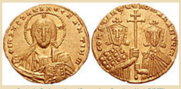
Constantine Porphyrogenitus and Romanus II on a Byzantine gold coin (945-959)

One of the theories of the Serbs` origin claims that they come from the area of former Boiki, in western Ukraine. From there, the "White Serbs" set out for Europe along the Tisa River and settled in the Balkans. Historical evidence of this theory is also contained in the writings of the Byzantine emperor Constantine VII Porphyrogenitus. In Chapter 32 of the Book of Nations (or "On the Administration of the Empire"), he emphasizes that Serbs descended from unbaptized Serbs and that they had long been inhabiting the other side of "Turkey" (today's Hungary).