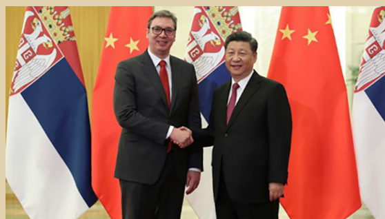
President of the Republic of Serbia Aleksandar Vucic and President of the People's Republic of China Xi Jinping

The Republic of Serbia is one of the countries which has decided to use this unique historical development opportunity. Serbia has been a member country of the 16 + 1 Cooperation Process since its establishment in 2012, and it is one of the most active ones. Within its framework, in the past six years, the project of revitalization and construction of the Budapest-Belgrade railway, construction of several sections on the Belgrade-South Adriatic highway, construction of bypass around Belgrade, revitalization of block 2 of the Thermal Power Plant in Kostolac and construction of a new block 3, revitalization of the Drmno surface mine and numerous other projects are under way or already implemented.