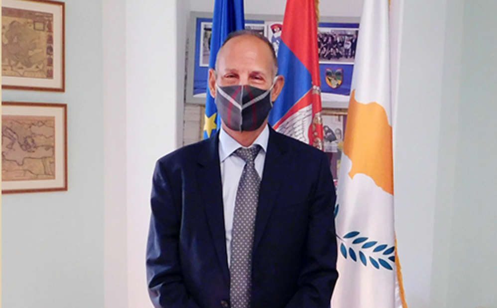
H.E. Constantinos Eliades, Ambassador of the Republic of Cyprus to Serbia

- Serbia is one of the countries with which we have no disagreements at all, emphasized H.E. Konstantinos Eliades, Ambassador of the Republic of Cyprus to Serbia, which has been using the services of Property management and rental company Dipos Belgrade for several decades, during the visit of Dipos representatives.