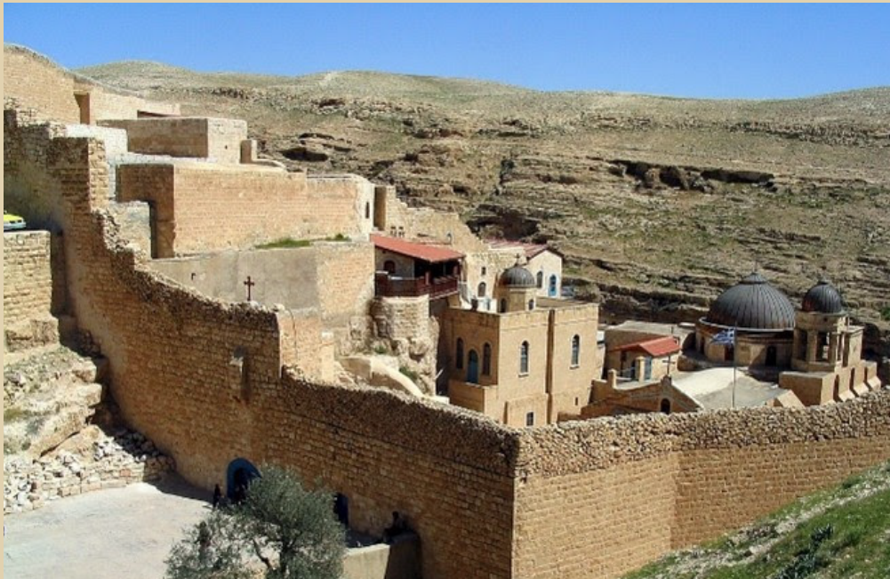
Monastery of The Holy Lavra of St. Savas in the State of Palestine

Returning to the very beginnings of the relations between Serbia and Palestine, he reminded that even Saint Sava spent a number of years in this country. The people accepted him there as a prince and a spiritual leader. The oldest monastery in Palestine was named after him - the Monastery of The Holy Lavra of St. Savas, or Mar Saba.