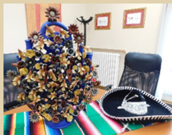
Details from the Embassy of Mexico