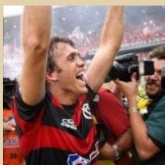
Details Dejan Petkovic Rambo