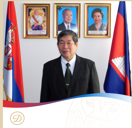
H.E. Tan Vutha, Ambassador of the Kingdom of Cambodia to Serbia

The Kingdom of Cambodia and the Republic of Serbia have always supported each other in the international arena. Long-standing friendship and good cooperation over the years has been based on shared interests, mutual respect and non-interference. Both countries have struggled to protect their national sovereignty, territorial integrity, peace and stability in their own countries, as well as in the whole region.