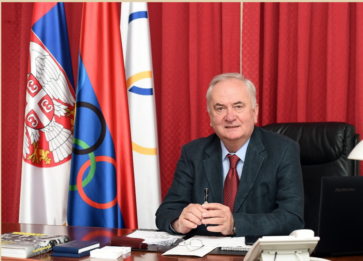
Бождар Маљковић, председник Олимпијског савеза Србије

The Olympic Committee promotes sports among children and youth with great enthusiasm. In the last three years, numerous activities have been organized in about 60 cities in Serbia, in which hundreds of thousands of children have participated. This activity is especially important considering that a small percentage of the youngest generations are involved in sports.