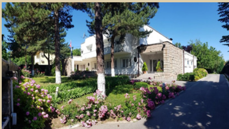
Real estate from the Dipos portfolio, which the Cuban embassy uses for as embassy and residence