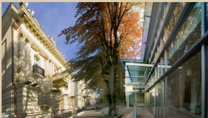
Kneza Milosa no. 56 - property from the Dipos portfolio, which the Embassy of the Republic of Italy in Belgrade uses for the Institute for Culture in Belgrade