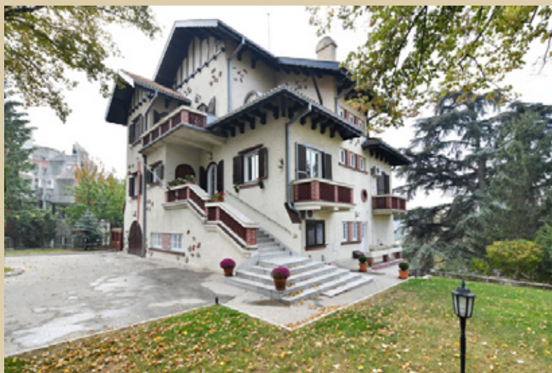
Real estate from the Dipos portfolio, which the Danish embassy uses as residence